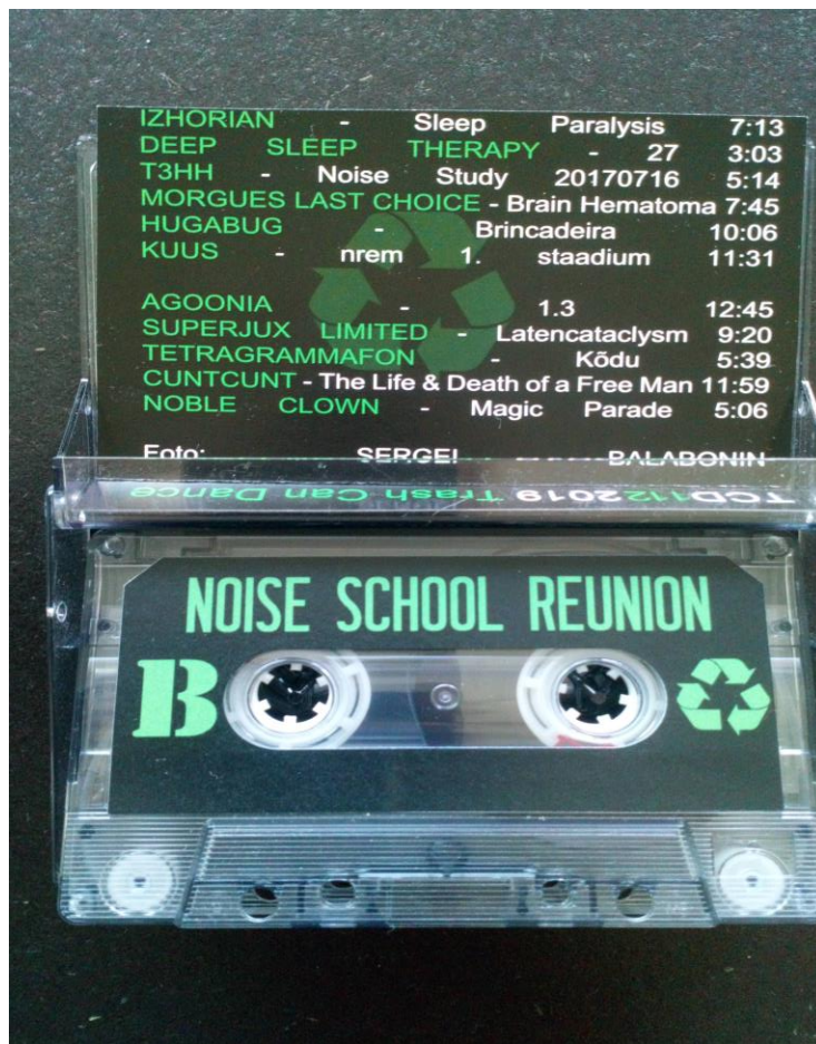
KUUS track at Noise school reunion, 2019 (TCD)