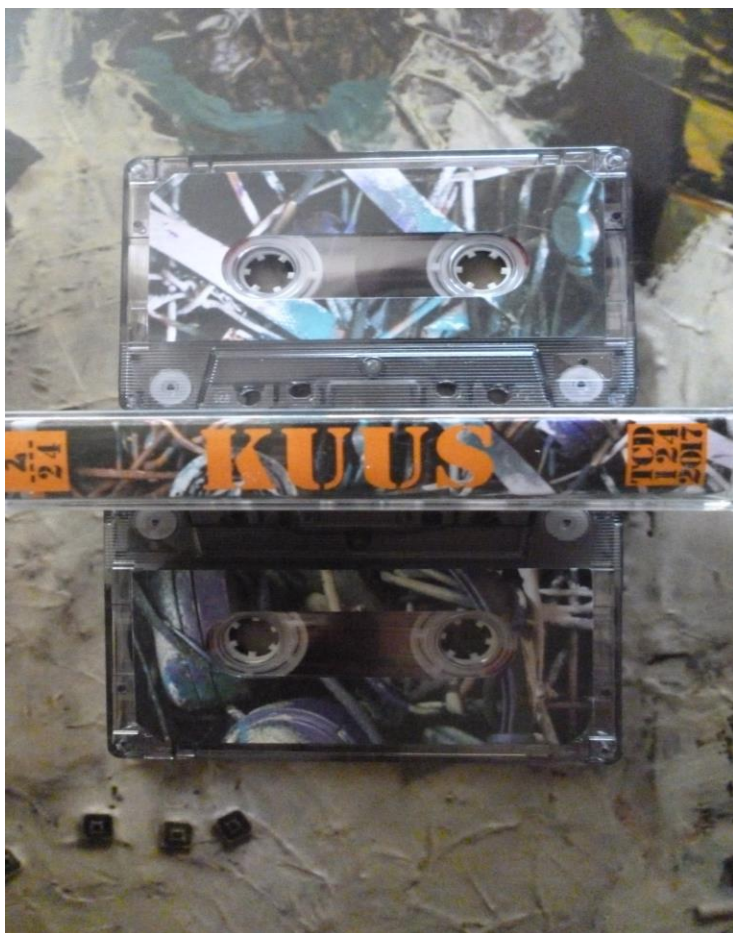
KUUS 2017 cassette (TCD)