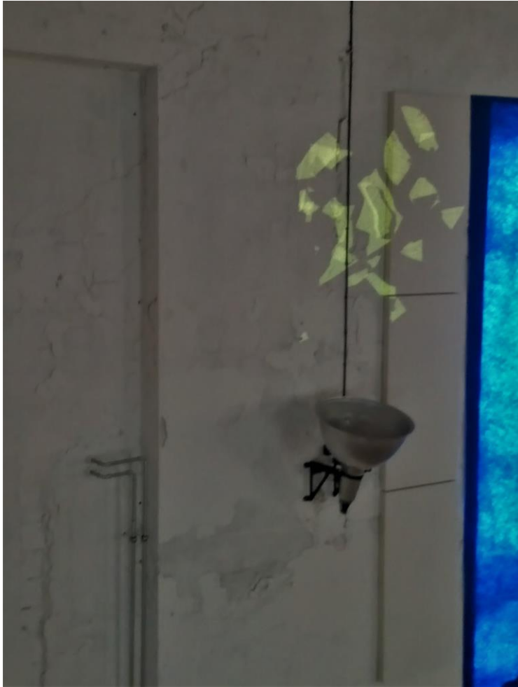
NREM stage 1