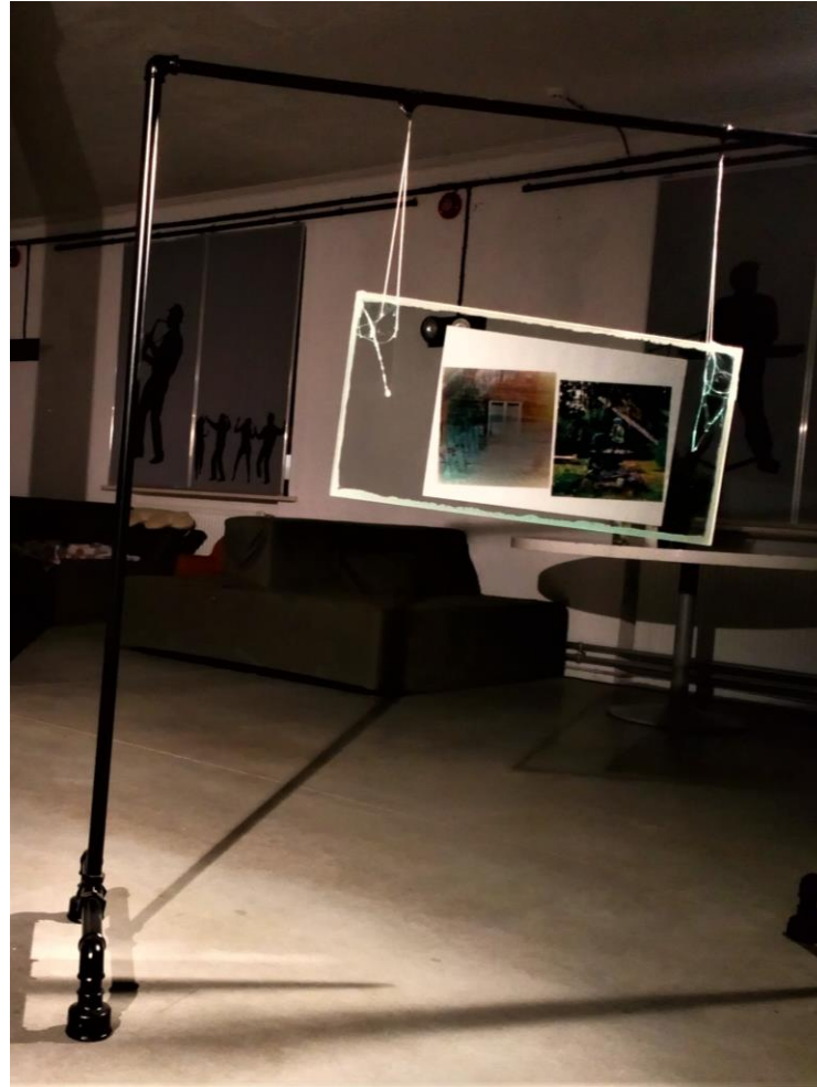
REM stages 1,5